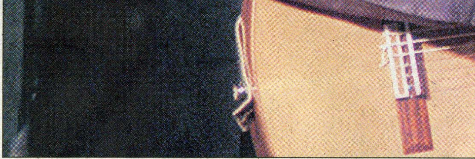
Dominic Chianese (Uncle Junior on HBO’s “The Sopranos”) croons “Italian